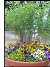
Plants and flowers